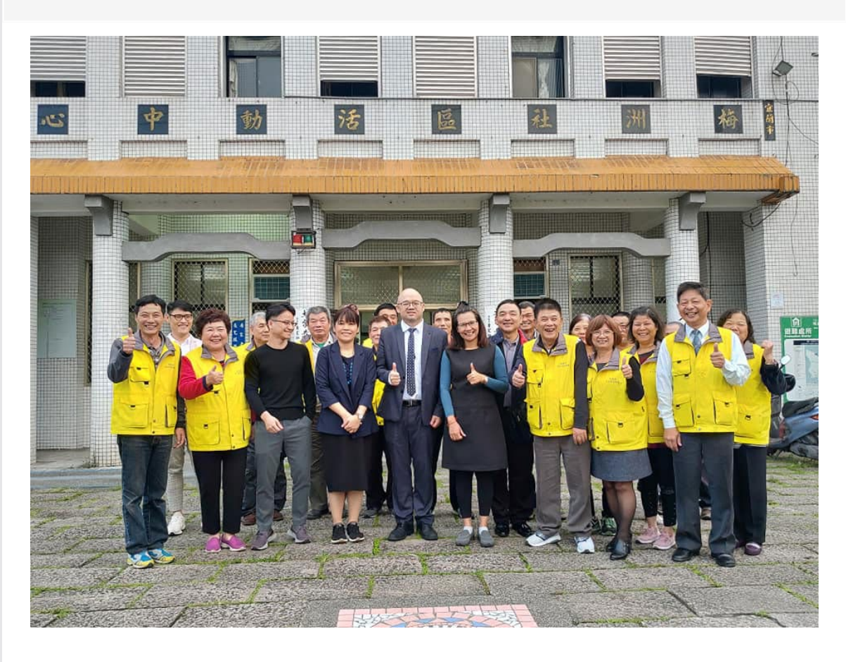
Thursday, December 19, 2019

A workshop on disaster governance and preparedness which brought together the wealth of knowledge and experience between academia and local communities of Thailand and Taiwan was held in Meizhou Community, Yilan County, Taiwan.